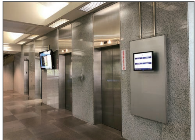
wayfinderPost and digital bulletin board at the elevator