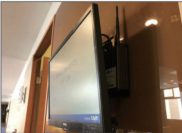
CAYIN's SMP players support Wi-Fi

NCCU College of Commerce has a rich history that leads the academic world in business administration in both educational resources and quality alumnus. But the pursuit of knowledge is never-ending, and the administration does not hold back when investing resources on creating the most updated learning environment. NCCU aims to become one of the top educational leaders in Asia by providing the best for its students.