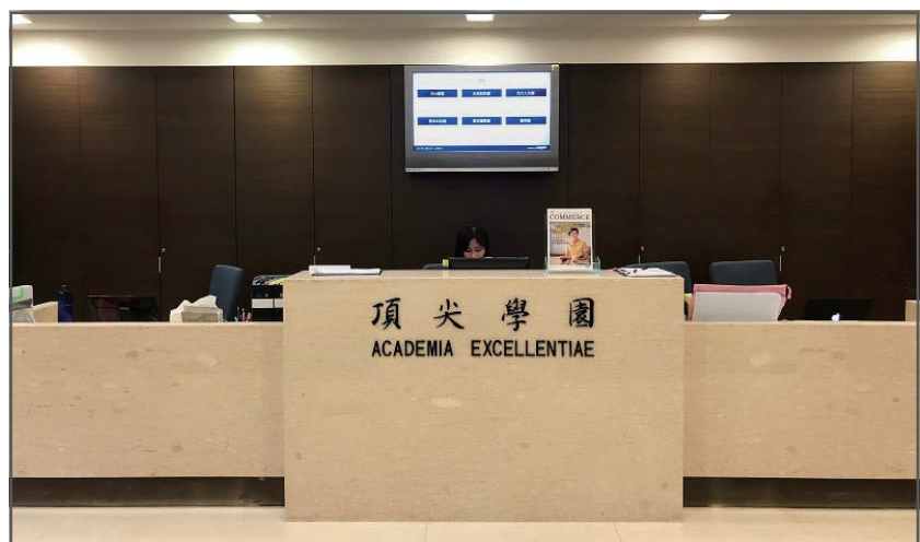
CAYIN's digital signage wayfinderPost at the reception of NCCU's Academia Excellentiae in Taiwan

In collaboration with Taiwanese Government's "Aim for the Top University Project," National Chengchi University (NCCU) established Academia Excellentiae in 2008. The facility was designed in inspiration of Harvard's HBS campus, providing EMBA curriculums for professional students, and venues for other programs such as IMBA and rentals. The 5 amphitheater classrooms and the function hall are under management by the Participation Education and Research Development Office.