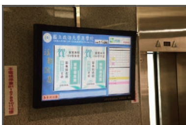
Digital billboard is a great way to communicate across departments

In order to create a convenient way for student to keep track of their schedule, the Academia Excellentiae sets up a dual output player to display the synchronized classroom information by the elevator on the first floor, and at the reception on the sixth floor. The wayfinderPost presents the location of the course, the speaker, and the timetable. This significantly reduces the time students and teachers spent on trying to locate the class when on campus. The 42" display by the reception also circulates announcements and marketing materials regarding the whole campus, which allows passerby to resonate with NCCU's brand and culture.