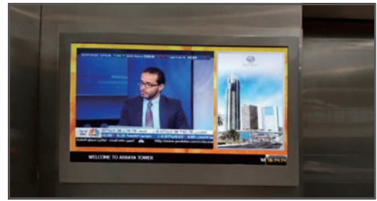
Satellite streaming through wireless digital signage solution in elevators.