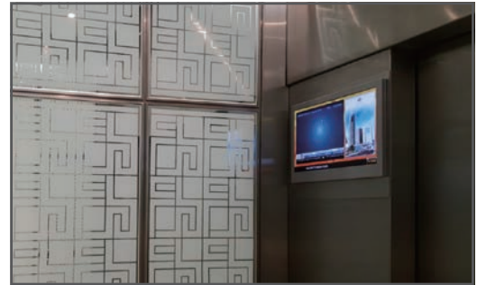
Customized display matching with elevator design.

The video streaming comes from a satellite dish and is distributed to all the players via the AV-in enabled server. Ensuring a stable connection throughout the entire process was crucial, as it took around 8 stages for the signal to reach the full HD display customized to match the interior design of the elevator. The CMS server acts not only as a management center, but also as a stabilizer between the incoming signal from the satellite and the SMP players.