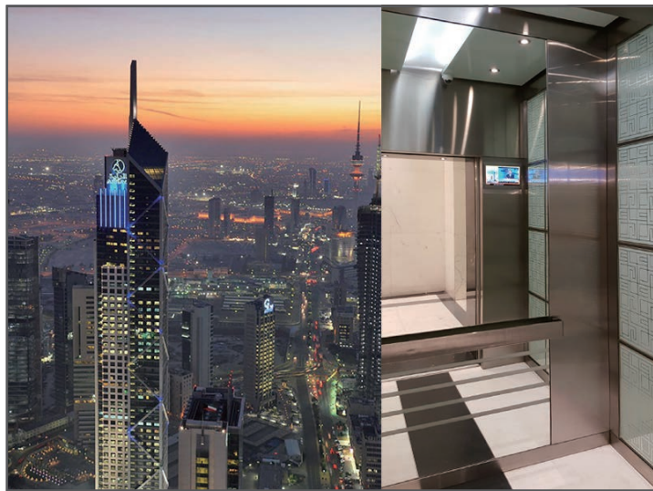
Kuwait skyscraper chooses CAYIN's digital signage for wireless elevator solutions.